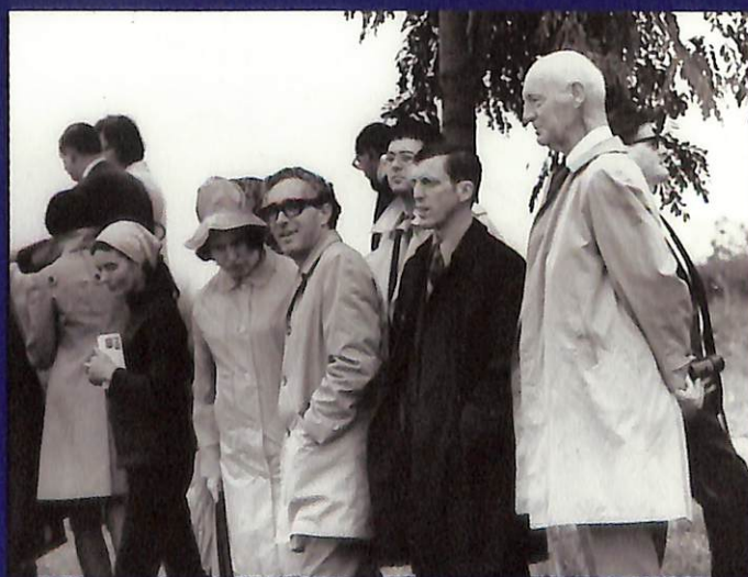
Szekesfehervar (Hungary, 1972)