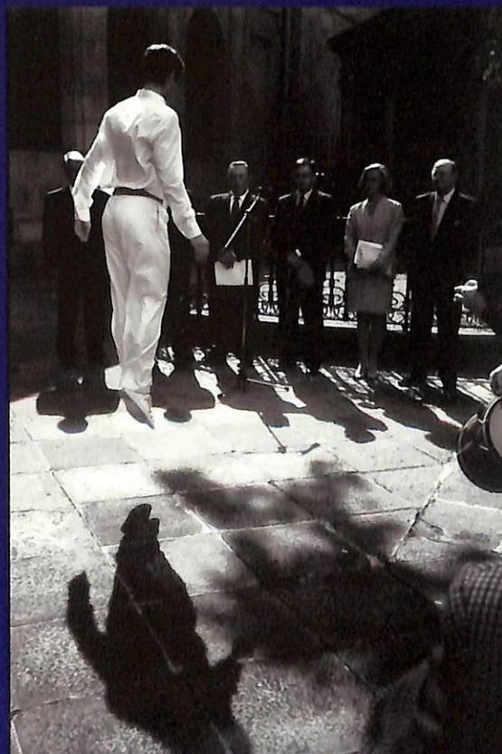
Gernika, Basque Country (Spain, 1997)

Corresponding member of the Institut de France Honorary President of the International Commission for the History of Representative and Parliamentary Institutions / Commission internationale pour l'Histoire des Assemblées d'états.