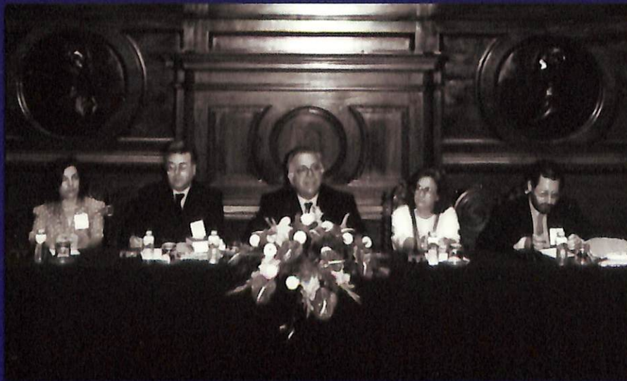
Lisbon (Portugal, 1992)